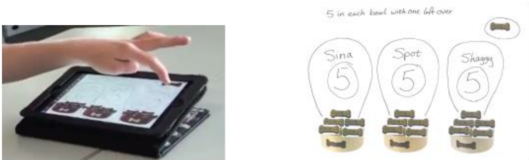
Figure 2: Fred's screen with his solution (a sketch is also provided as the iPad screen is not clear)

Fred downloaded images of dog bowls and biscuits from the internet and positioned five dog biscuits onto each bowl, see Figure 2.