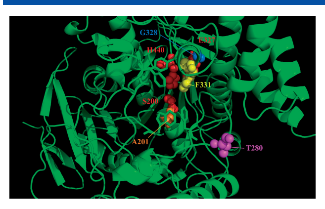
Figure 1. Three-dimensional structure model of Tetranychus urticae AChE1. The backbone of the enzyme structure is rendered as green ribbon with secondary structure. The catalytic triad (S200, E327 and H440) appears as Van der Waals red spheres. The different amino acid substitutions are shown as Van der Waals coloured spheres. The view points to the entrance of the catalytic gorge.