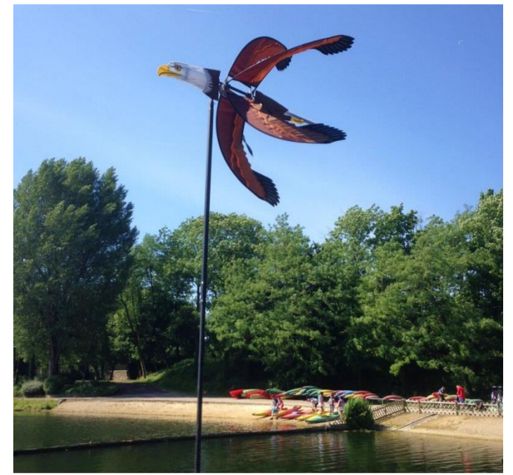
Figure 1: Scarecrow (Eagle) to scare off birds.

A part of this project was to test the hypothesis of bacteriological contamination by aquatic birds massively occupying the leisure center (fig.1) using a microbial source tracking technique. This approach relies on the quantification by real-time PCR (qPCR) in water, sand, and sediment of bacterial specific markers of the digestive tract of different animal species (geese, seagulls, dogs) and humans.