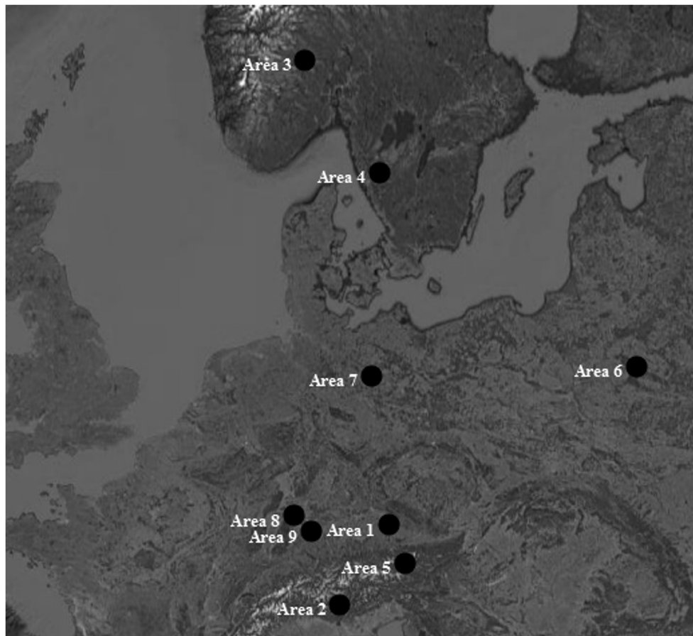
Fig. 1. Distribution of roe deer ( Capreolus capreolus ) study areas in the EURODEER network, considered in this work. Area 1: Bavarian Forest National Park and Sumava National Park; Area 2: Italian Alps; Area 3: Norway; Area 4: Sweden; Area 5: Austrian Alps; Area 6: Bialowieza Forest; Area 7: Brandenburg; Area 8: Baden-Wuerttemberg (Rhine Valley); Area 9: Baden-Wuerttemberg (Hegau).

management (Appendix S2). This information included the typology of feeding station, that is, whether a feeding site was a proper feeding station or a box trap baited with food and used to lure and capture roe deer; the energetic quality of the food provided, which we reclassified as low or high based on the average values of metabolizable energy (ME, MJ/kg of dry matter) of the food supplied; the potential presence of competitors for access to food, which we derived from a combination of the mere presence of competitors for food in the area (based on sightings and site-specific knowledge, e.g., issued from wildlife management plan), and the accessibility of the feeding station site for the competitor species (e.g., presence of wooden bars to prevent the use of feeding stations by species larger than roe deer); the activation