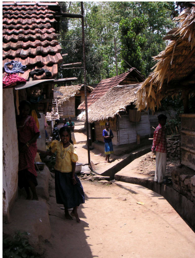
Photo 1. The village of Kadavu, increasing population and limited land (23/05/05).

With the history of the villages, we can now understand the importance of activities exploiting the forest area and the development of the region for its inhabitants. The Kadar community (Earth Dam, Kuriarkutty, Sungam, part of Kadavu) have been very involved in forestry activities, working for woodcutting, creating and maintenance of teak plantations. Before the Peruvuripallam dam was built, the Malasars of the village of Sungam were living more to the east and until the 1950s earned their living from forestry work and a bit of farming (Pugazhendi, 2002). These two ethnic groups were semi-nomadic and were largely employed by the Forest Department. Several Malamalar families, semi-nomadic food gatherers, lived in the area of the Parambikulam reservoir, and were displaced and grouped in Fifth Colony when the dam was opened. The Muduvan inhabitants of the village of Poppara, are thought to have migrated from the south in the 1950s and 1960s. They were nomadic farmers, but have today adopted a sedentary mode of life.