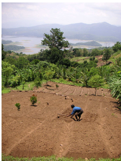
Photo 2. Terraced farms in Poppara, with a view on the Parambikulam reservoir (21 May 2005).

the time there were 12 guides, thus illustrating a better distribution of activities related to tourism. The EDC gave 3 boats to the village and trained 8 persons to sail them. Even though there were not many tourists (one tour a day during the tourist season), the boats allowed fishing activities which provided the inhabitants with some revenue.