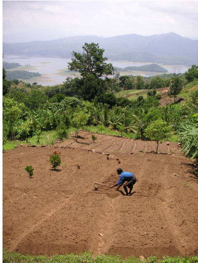
Photo 2. Terraced farms in Poppara, with a view on the Parambikulam reservoir (21 May 2005).

the time there were 12 guides, thus illustrating a better distribution of activities related to tourism. The EDC gave 3 boats to the village and trained 8 persons to sail them. Even though there were not many tourists (one tour a day during the tourist season), the boats allowed fishing activities which provided the inhabitants with some revenue.