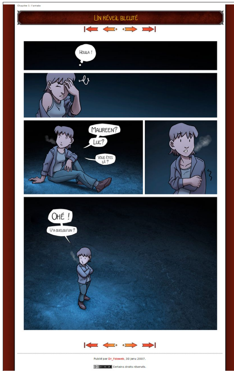
Figure 4: Example of a comic distributed in 'page' format, presented here with its reading environment. Dr Folaweb, Deo Ignito , Webcomics.fr, 2007–2015, available at: http://deognito.webcomics.fr [Last accessed 11 March 2016], © Dr Folaweb.