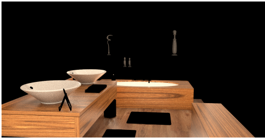
(b) Last bounce on a reflectance with non-null covariance