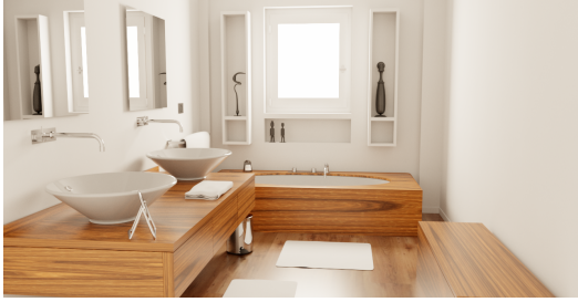
(a) Original render. Bathroom scene as featured in PBRT