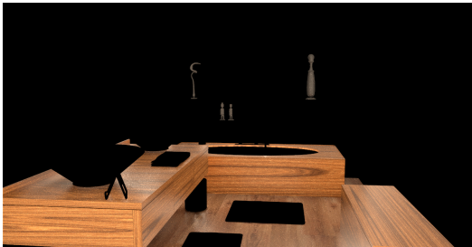
(c) Last bounce on a reflectance with covariance norm > 2