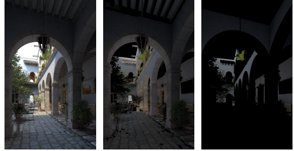
(a) Original render. (b) Last bounce on a texture with non-null covariance. (c) Last bounce on a texture with covariance norm > 6 .

We present the first results generated using our implementation based on the PBRT renderer [PH10]. Figure 2 shows layers extracted considering the texture rays last bounced on before reaching the camera. Figure 2b retains only paths with non-null covariance, keeping the contribution of most surfaces but discarding the sky and glasses (lights, painting). Setting the minimum norm to 6 isolates high-frequency textures such as roughcast walls and ceiling or veined leaves. Figure 3 also discriminates on the last bounce, considering the reflectance operator this time. In figure 3b, purely diffuse walls and towels have disappeared as only non-null reflectances are targeted. In figure 3c, selecting reflectances exhibiting a covariance matrix of norm greater than 2 isolates the lacquered wood on the furniture, which is glossier than the ceramic composing the sinks. This effectively allows us to disambiguate the otherwise generic symbols S and D of Heckbert notation.