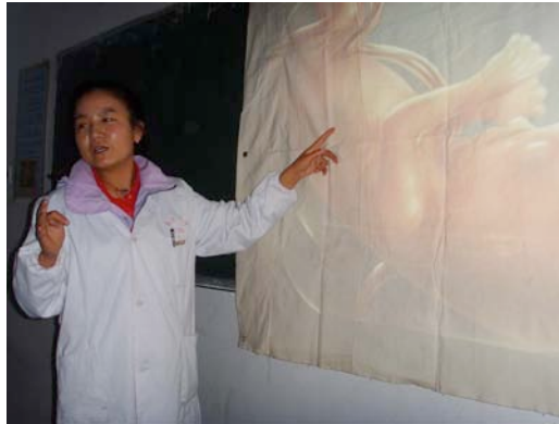
Fig. 3. A Tibetan woman doctor showing a picture of a foetus on a makeshift screen during a field trip, Xunhua District (Qinghai Province).

health. This woman doctor, Palmo added with satisfaction, has given such a talk in front of a total of 10,000 persons, including men: “She is really brave!” 22 In a world where women rarely speak in public (the only public arena where they are conspicuous is the singing scene), a woman speaking about private health problems to men is indeed rare enough, and thus important to mention in this context.