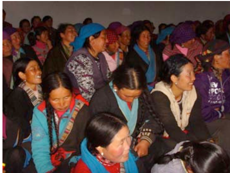
Fig. 2. First evening of the field trip in Xunhua District (Qinghai Province). Photo: Courtesy of Demoness Association, 2011.