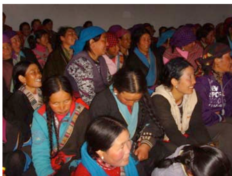
Fig. 2. First evening of the field trip in Xunhua District (Qinghai Province). Photo: Courtesy of Demoness Association, 2011.