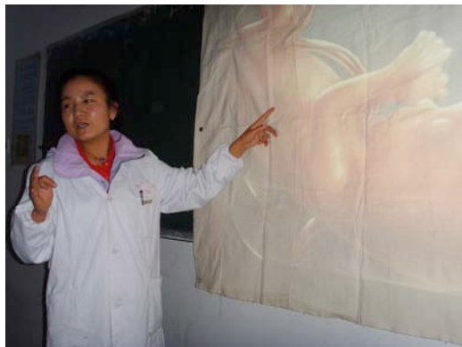
Fig. 3. A Tibetan woman doctor showing a picture of a foetus on a makeshift screen during a field trip, Xunhua District (Qinghai Province).

health. This woman doctor, Palmo added with satisfaction, has given such a talk in front of a total of 10,000 persons, including men: “She is really brave!” 22 In a world where women rarely speak in public (the only public arena where they are conspicuous is the singing scene), a woman speaking about private health problems to men is indeed rare enough, and thus important to mention in this context.