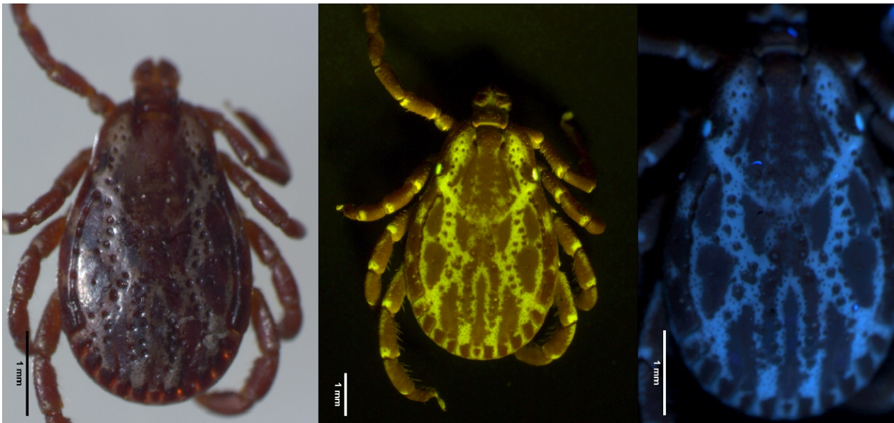
Figure 1 Micrographs showing a dorsal view of Dermacentor variabilis (male) to compare each light source. White light (left), royal blue (RB, 440-460 nm) (middle) and ultraviolet (UV, 360-380 nm) (right). Variation in ornamentation illuminated by the different light sources can also be noted.

Table 1 shows the positive and negative results for fluorescence in both sexes. The following structures showed fluorescence in all species and sexes: anal groove, genital pore, spiricals, setae, ventral idiosoma, hypostome, palpal articles, cheliceral sheath, leg segments, arthrodial membrane, and the apotele. All species with eyes and ornamentation present showed fluorescence in those structures (Figure 1). Fovae and lamellae were intentionally observed only in A. americanum females due to limited access to a fluorescent microscope, but these structures are presumed to be fluorescent in females of the other species. Portions of the basis capitulum are not fluorescent in I. scapularis contrary to the other species.