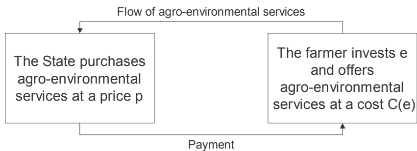
Figure 1: Contract description when trade occurs

We consider two contracting parties, the State and the farmer. Figure 1 shows the relationship between these two parties.