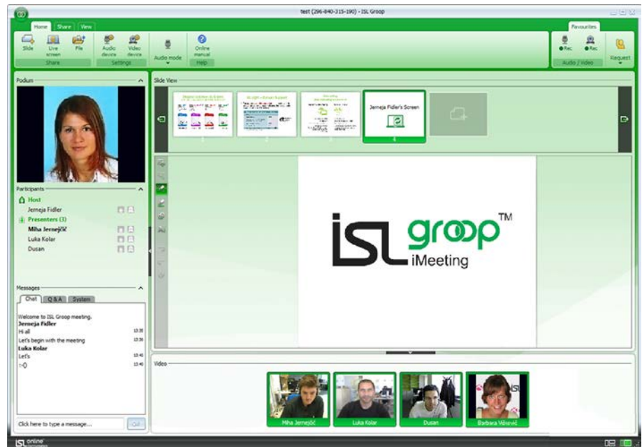
Figure 3. ISL iMeeting