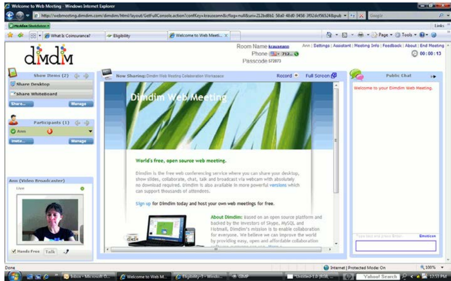
Figure 2. Dim Dim e-learning platform