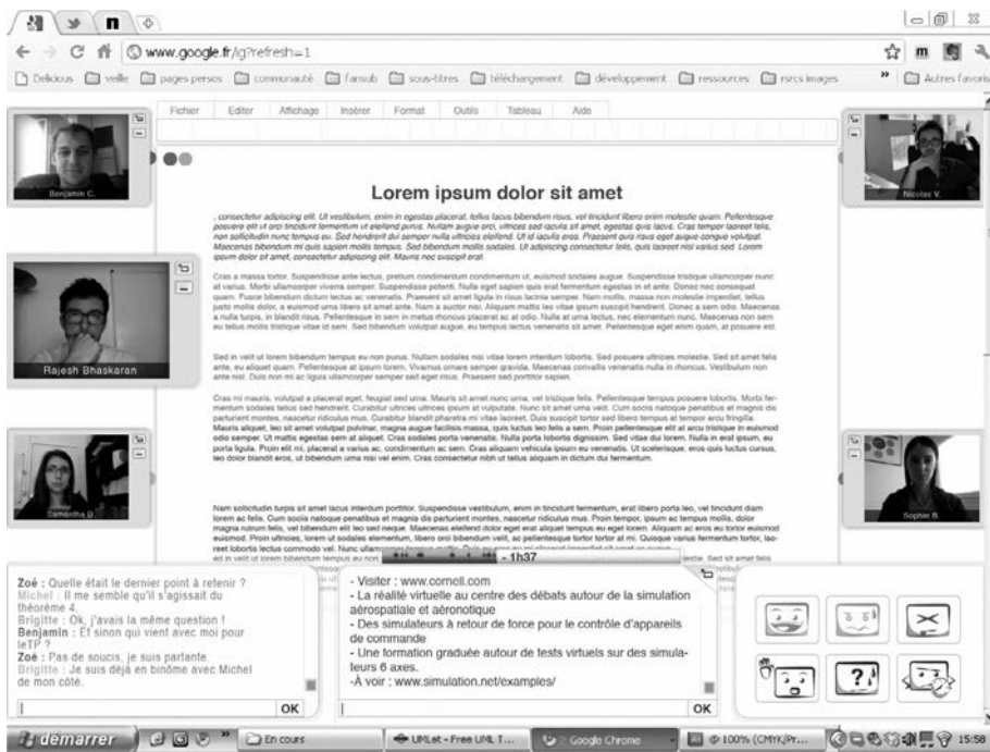
Figure 10. The interface in group work mode with document, VUE

empowers users to choose the relevant point of view, as if choosing from different cameras. What the tests showed was that a number of features were thought as “natural” even though they came from a translation of different techniques of mediation.