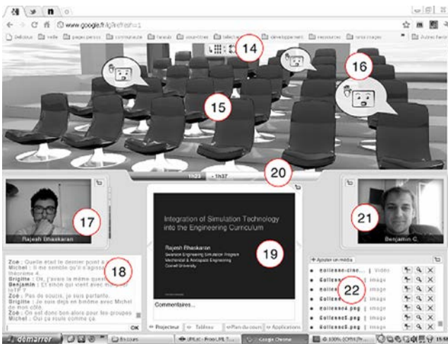
Figure 7. Description of the interface for the student