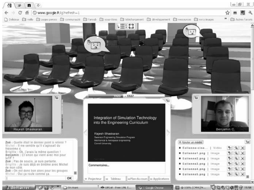
Figure 6. Teacher interface in conference mode, VUE