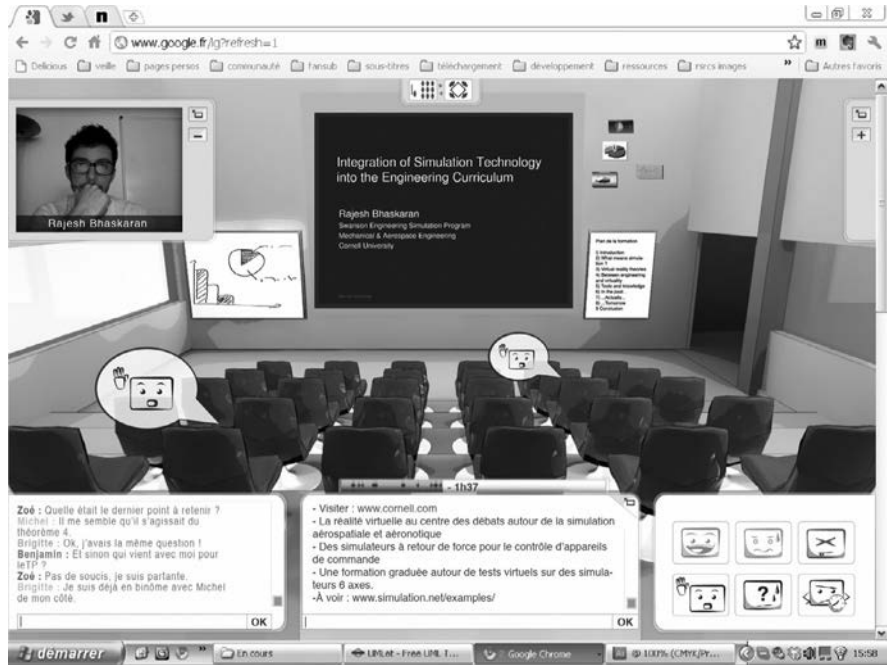
Figure 5. Student interface in conference mode, VUE