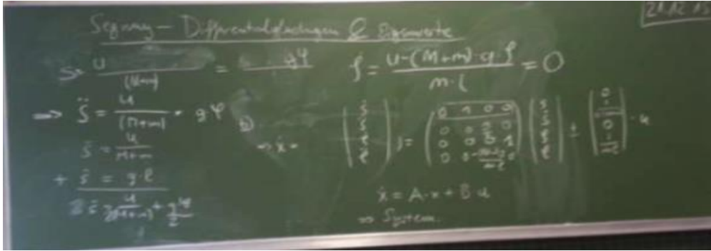
Figure 3: Development of a linear time-invariant system on the blackboard

forces. The linearisation for the functions sine, cosine and quadratic function were discussed geometrically on the blackboard but the general concept of Taylor-approximation has not been introduced to the students. After linearisation, the two equations can be summarised into a linear time-invariant system introducing a so-called state-space vector. This phase of the project was designed by lessons with question and development. The introductory phase of the study preparing the three project days was concluded by the formulation of the linear time-invariant system that was jointly developed on the blackboard.