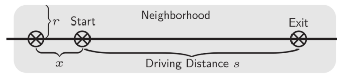
Figure 2: Bus line

A solution for the more complex version is based on the idea of covering the city with circles of the same diameter in a regular pattern where the centres of the circles are the bus stops. In a second step a rule is developed based on the adjustment of the bus stops to the requirements of the city-map. The diameter of the circles has to be calculated, which leads to the distance of two bus stops by a certain bus line. For this problem there are a lot of possible aspects that can be considered. One possible approach is to reduce the bus line to a straight line, where the bus stops all have the same distance to the next stop.