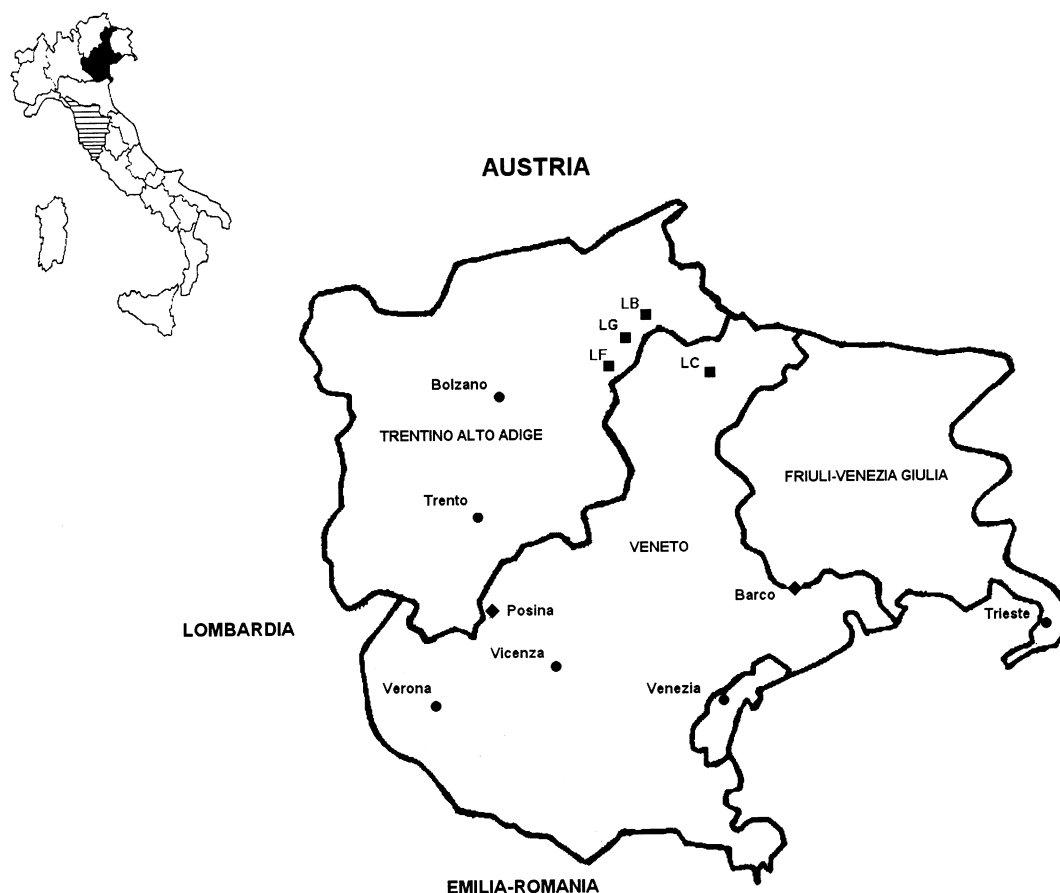
Fig. 1. Map of the three main regions in Venetia. Note: The shaded area in the map of Italy indicates the administrative region Veneto. The striped area in the map of Italy indicates the administrative region Tuscany. ■, Villages studied by Stenico et al (Stenico et al. 1998). Ladin-speaking samples: LG, Selva Val Gardena Wolkenstein, LC, Colle Santa Lucia; LF, Fassa and LB, Badia. ♦, The two Veneto-speaking samples, Posina and Barco.

habitations in the Euganei Venetian territory since the upper Paleolithic period (35000–10000 years).