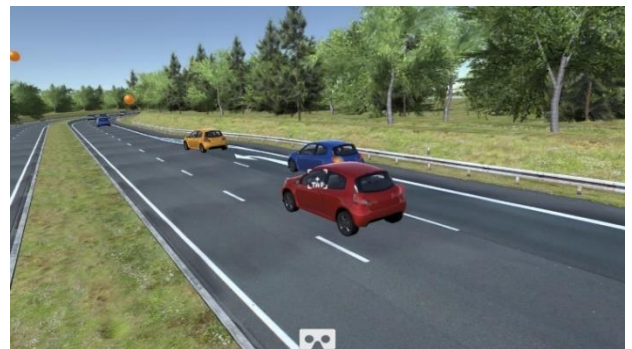
Figure 1 - Screenshot of the first version of 3DAV Explore

network definition, a traffic model to manage autonomous cars, a rendering engine, a user interface, all in real-time and running in an interactive way.