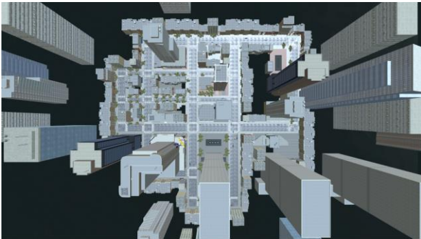
Figure 8 – American city model top down view

The city used for the latter scene was created using assets from the Modern City pack ( https://www.assetstore.unity3d.com/en/#!/content/18005 ). It contains a selection of building meshes (FBX format) as well as various props (Bus stop, signs etc...) made with the Autodesk software series, optimized for use on a mobile platform (Figure 8). The layout was designed to form a closed road network.