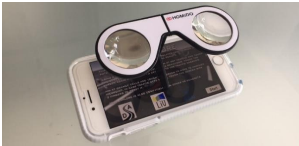
Figure 3 - A Homido mini VR viewer installed on a smartphone for stereoscopic view of the 3DAV Explore application

Moreover, a second version was developed, adding more interactions as well as networking functionalities. The users drive a car in an American city using a mobile device. The car's steering wheel is controlled by the device's tilt while two touch-controlled buttons serves as the brake and throttle (Figure 4).