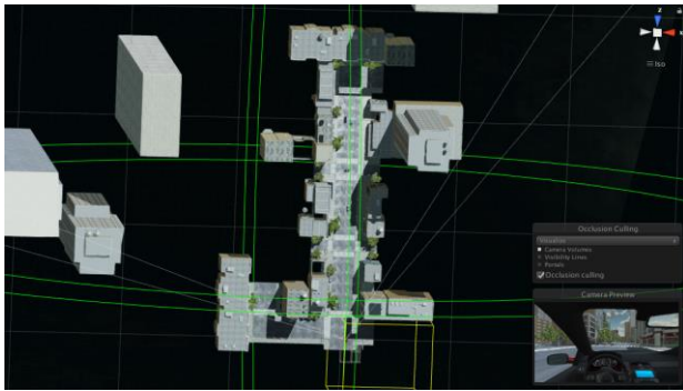
Figure 11 - Illustration of the Occlusion culling in the city scene

The rendering engine used depends on the device the application is built on: Metal for iOS devices, OpenGL ES for Android and DirectX for Windows