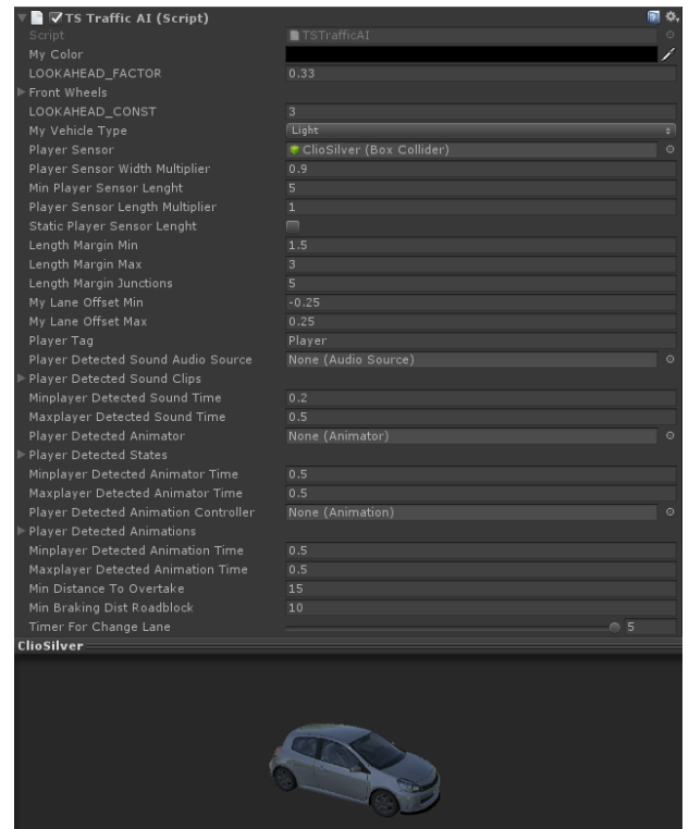
Figure 10 - "ITS Traffic AI" component parameters

behavior parameters such as the minimum distance to overtake, the time for lane changing, detections distances, position on the lane etc. (see all component parameters in Figure 10).