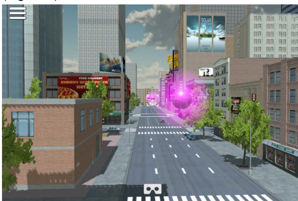
Figure 5 - Outside view of vehicle and pink dots

Two different modes of transportation are available to the user in this second application. By default, the user is placed outside of any vehicle, flying above the road. In this mode, he can move around the city by targeting the pink dots scattered all around the scene (Figure 5).