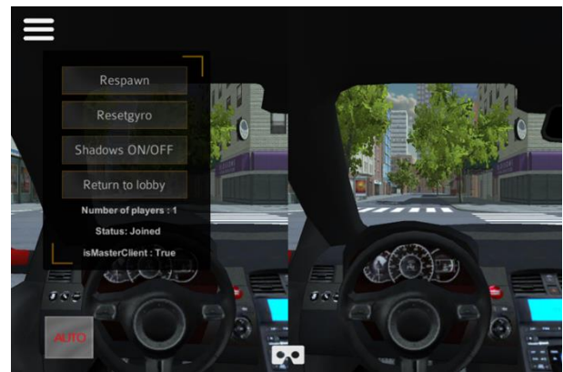
Figure 7 – Menu options

In both modes a button on the bottom of the screen allows to switch between 2D and 3D view to be used in a VR headset. While in 3D mode, the vehicle is controlled by the head's movements. Leaning forward and backward will accelerate and decelerate respectively and left/right movements will allow to turn the wheel and look around.