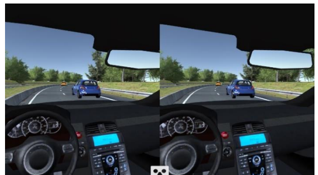
Figure 2 - Screenshot of the first version of 3DAV explore in virtual reality mode