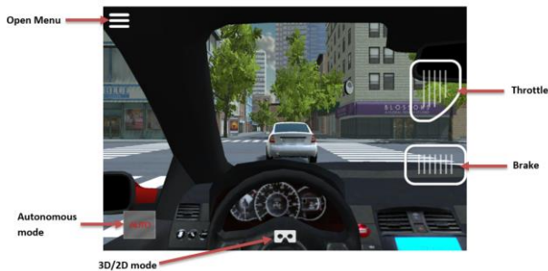
Figure 4 - Driver's view and UI

Moreover, a second version was developed, adding more interactions as well as networking functionalities. The users drive a car in an American city using a mobile device. The car's steering wheel is controlled by the device's tilt while two touch-controlled buttons serves as the brake and throttle (Figure 4).