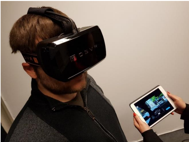
Figure 13 - A user of 3D AV explore, running the virtual reality mode

latest virtual, augmented and mixed realities technologies may thus be used to provide natural and collaborative review tools (Figures 1 and 13).