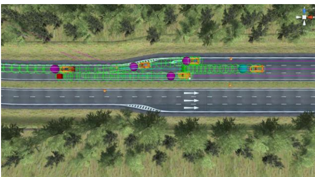
Figure 9 - ITS Traffic component in action in the first version of 3DAV explore

The traffic component also offers a simple car spawning component, which handles car addition during the simulation in real-time. It was configured to spawn cars in a 250 meters radius from the main point of interest of the scene: the lane merging point (see Figure 9).