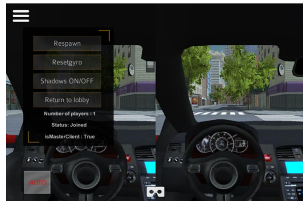
Figure 7 – Menu options

In both modes a button on the bottom of the screen allows to switch between 2D and 3D view to be used in a VR headset. While in 3D mode, the vehicle is controlled by the head's movements. Leaning forward and backward will accelerate and decelerate respectively and left/right movements will allow to turn the wheel and look around.