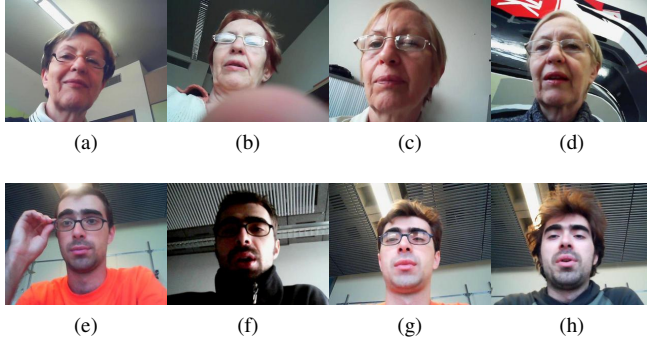
Figure 1: Example images from two individuals. It can be seen that there is significant pose and illumination variation between all of the images. Also, it can be seen that the facial hair, (e)-(h) as well as hair style and make-up, (a)-(d), fluctuates significantly.

Below we describe how the database was acquired, including the recording protocols that were followed.