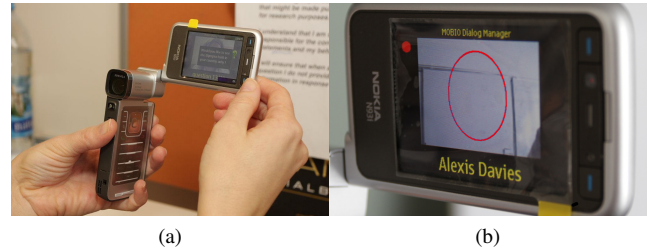
Figure 2: Example images showing how the data was captured when using a mobile phone. In (a) there is an example of a user holding the mobile phone for a recording and in (b) there is an example of the video feedback to the user with the ellipse (in red) in which the face is meant to be within; note that the image in (b) has been digitally altered to enhance the ability of the reader to see the red ellipse.

To ensure that the acquired data was meaningful and useful two automatic tools were used to validate the audio-video samples. The first tool was a simple speech/non-speech detector 2 that allowed us to measure the signal-to-noise ratio (SNR). If the SNR for an audio-video sample was higher than 6 dB then the sample was inspected by a human