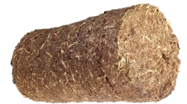
Log of grass