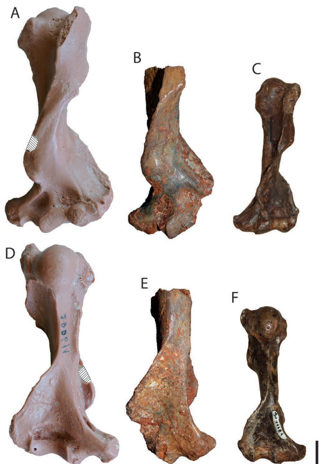
Figure 3. Comparative anterior (A, B and C) and posterior (D, E and F) views of the humeri of the type specimen of Necromanis franconica SMF 2006/1 (reversed here for easier comparison, A and D), the specimen from Pech du Fraysse PFY 4051 (B and E) and the type specimen of N. quercyi MNHN QU 11181 (reversed here for easier comparison, C and F). The hatched areas represent broken parts on the specimen of N. franconica . Scale bar = 1 cm.

Within extant pholidotans, the habitat differentiation has occurred independently in both African and Asian lineages (Gaudin et al. , 2009). This parallel evolution gives us a unique opportunity to separate the effect of phylogenetic and ecological constraints on morphological evolution of their humeri. One Asian (i.e., M. crassicaudata ) and two African species ( M. temninckii and M. gigantea ) have a fossorial lifestyle; they show a robust humerus characterized by a broad deltopectoral crest that extends distally close to the entepicondylar bridge. In contrast, the other species (the Asian M. javanica and M. culionensis , and the African M. tricuspis and M. tetradactyla ) have a more arboreal lifestyle; their humeri show a smaller deltopectoral crest that inserts further mesially from the entepicon-