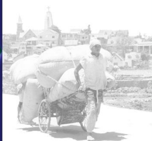
DIALOGUE est une publication de DIAL