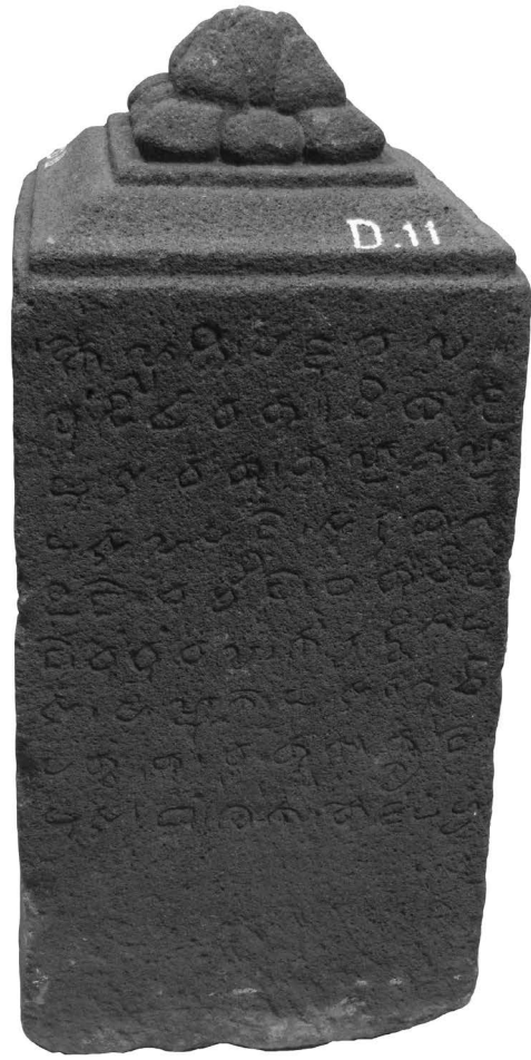
Figure 3. — Photo taken by Emmanuel Francis in 2010 of the same stone as shown in fig. 1, face B.