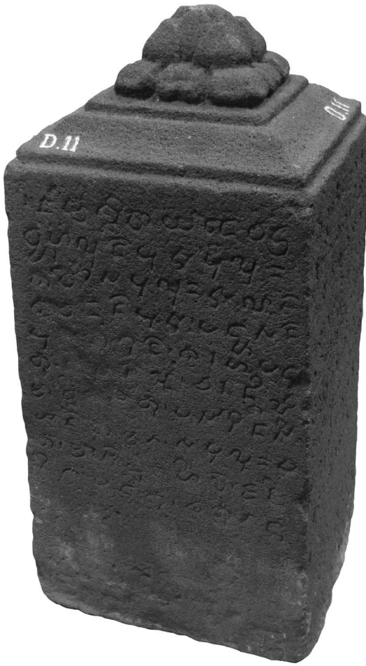
Figure 2. — Photo taken by Emmanuel Francis in 2010 of the same stone as shown in fig. 1, face A.