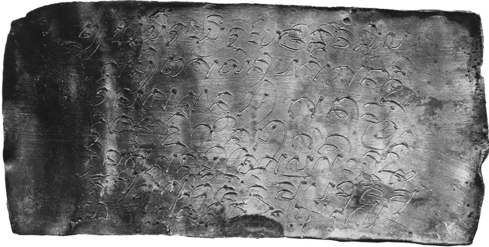
Figure 4. — Tin foil recovered from the Batang Hari River at Muara Jambi.