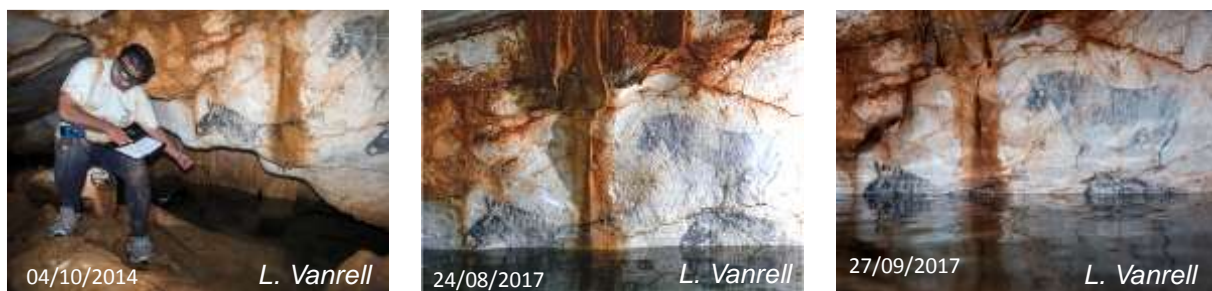
Figure 2: The water level inside the Cosquer cave at three hydrologic periods: a) 04/10/2014, the water level is low, the air pressure inside the cave is high; b) 24/08/2017, the water level is high, the bottom of the horses panel is flooded; c) 27/09/2017, the water level is very high, the air pressure in the cave decreased close to the outside atmospheric pressure.

avoids the water to rise on paintings and engravings located close to the sea-level, e.g. the horses panel. The air overpressure changes over the year and influences the art conservation. However, few measurements have been done to study this phenomenon. In 2014, on request of the regional agency of cultural affairs in charge of the study and conservation of the Cosquer cave (DRAC PACA, France), the CEREGE laboratory started a new scientific survey of the hydrogeological functioning of the cave. Pressure sensors have been installed in-situ, with a 5 minutes time-step recording, inside the cave in the air and in the water, in the sea, and in the air outside the cave (Figure 1). Pressure is converted to fresh or salted water column. We also benefited from the measurements done at the Port-Miou observatory (SNO Karst) located 5 km eastward from the cave, that gives access to pressure data and that can be used as reference for the hydrological states of the karst aquifers in the area (Arfib & Charlier 2016).