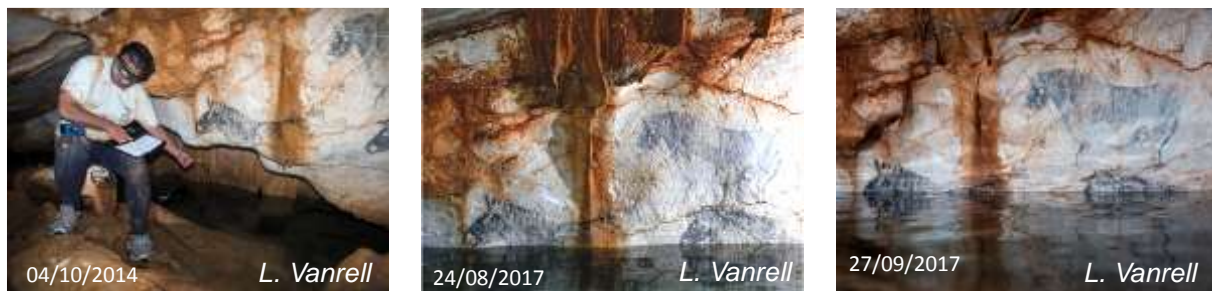
Figure 2: The water level inside the Cosquer cave at three hydrologic periods: a) 04/10/2014, the water level is low, the air pressure inside the cave is high; b) 24/08/2017, the water level is high, the bottom of the horses panel is flooded; c) 27/09/2017, the water level is very high, the air pressure in the cave decreased close to the outside atmospheric pressure.