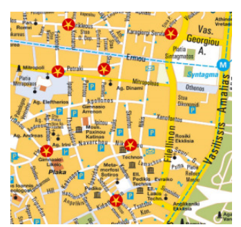
Figure 4: Game environment example – city center of Athens

of photos from the exercises that they will make later on their own inspired by the street artwork during the game. It is highly encouraged that the players add their personal findings from the streets of Athens or/and small group activities inspired from the city of Athens during their classes. In addition, before starting the game, they will select their character from a range of characters found in Greek children's books. The overall goal is to stop to as many street artworks as possible, gain points, create and propose new exercises and gladly become an explorer, an observer and the "future ambassador of learning in the city".