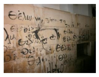
Figure 2: "I want to live life with everything"

The game environment as I have designed it, and explained in detail below, it would be the city map of Athens. There would be several spots on it: each one is leading the user to different street artefacts. In each spot, there would be a set of street artefacts that the users can explore. Two types of activities depending on the artefact will be proposed to the user: a) Linguistic exercises and b) Story-based exercises .