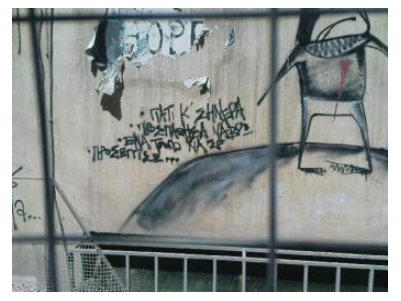
Figure 1: "Today, once more I tried to find a way to approach you"

"A wall is a very big weapon" argued some years ago the elusive street artist Banksy (Bansky 2001). Yet, in many parts of the world, street art is a juxtapositional phenomenon as it can be seen either as an aesthetic intervention or as a vandalism activity. Throughout human evolution, starting from primitive drawings on cave walls, humans have always yearned to express themselves and share their thoughts in a public way (Smith 2007). Today, especially in countries like Greece, all these public art practices are evidently part of our visual culture and open new potentials of considering them as part of our cultural heritage (Merrill 2014). And as stated by many street artists: empty walls are just canvasses in waiting, seen very little as something that should be damaged or destroyed (Halsey et al. 2006). On the contrary, they are perceived as surfaces in which they can express their personal beliefs and values on a daily basis, as a way that they can get their message out into the world and create a dialogue with others (Hughes 2009). In this way, street art is a means of communication, freedom of