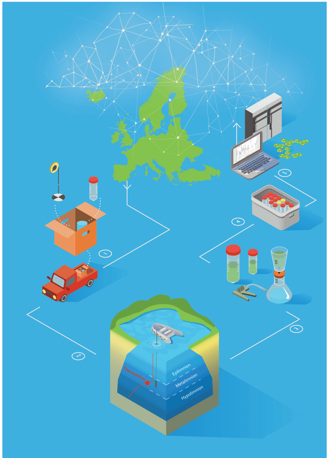
Figure 2. Schematic overview of the European Multi Lake Survey (EMLS). CyanoCOST and NETLAKE members performed the sampling routine by: 1. Preparing the sampling material to meet the standardized procedures 2. Accessing the lake site and acquiring integrated water samples from the bottom of the thermocline up to the water surface 3. Processing and preserving the water samples based on requirements for subsequent analysis 4. Shipping samples to a central receiving laboratory 5. Analysing nutrient, pigment and toxin concentrations in dedicated laboratories. After quality control checks and data integration the dataset returns to the European network and becomes publically available for further research. Created by Sarah O’Leary and Eilish Beirne.