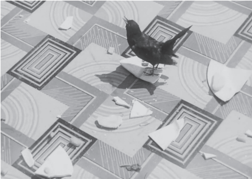
Figure 4: When the Pie Was Opened (Lye, 1941), 02:29