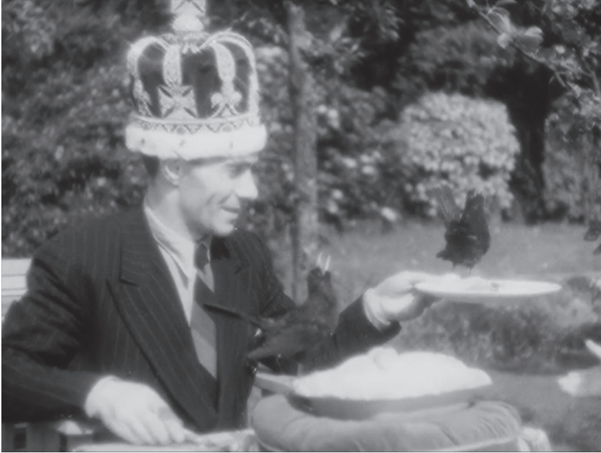
Figure 3: 'Wasn't that a dainty dish . . .' When the Pie Was Opened (Lye, 1941), 02:21