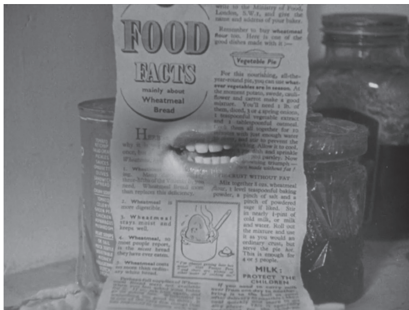
Figure 1: 'Take the season's vegetables . . .' When the Pie Was Opened (Lye, 1941), 04:09