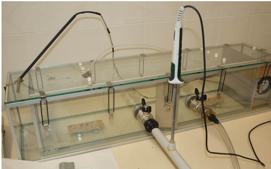
Figure 2. Set-up of the emission chamber according to the NF EN ISO 16000-9 standard.

A first set of measurements to determine the volatile organic compounds (VOCs), such as benzene, toluene, ethyl benzene, xylene and carbonyl compounds), were carried out in an emission chamber of 51 litres on 7 oak covers (emission areas between 0.11 and 0.22 m 2 ), which dated between the fourteenth and twentieth century. A total of 28 passive air samplers (Radiello®*) were introduced under steady climatic conditions (25 °C / 55 % relative humidity) according to the NF EN ISO 16000-9 standard and this for 7 days (ISO 16017 2006) (Figure 2). The samples were placed in the emission chamber after 48 hours of filtered air-wash cleaning in order to avoid any contamination.