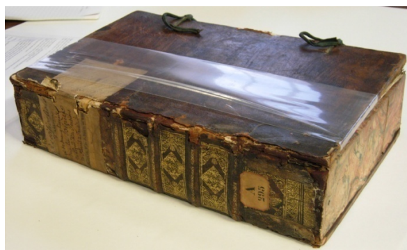
Figure 6. Oak box, French National Archives, room 117 – © A.-L. Dupont.

Four of the above-mentioned paper samples were placed in a neutral cardboard box and were kept in stable conditions in the laboratory (23° C and 50 % relative humidity) during the same period (14 months) as the control samples.