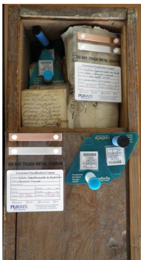
Figure 4. Exposure of Purafil coupons and Radiello samplers in one of the wooden boxes and in the ambient atmosphere at the departmental archives of Puy-de-Dôme – © M. Dubus.

A set of measurements was set up in the municipal archives of Toulouse and Montpellier, the departmental archives of Ardennes, Haute-Marne, Loire-Atlantique, Hautes-Pyrénées and Puy-de-Dôme, as well as in the archives of the national museums. Radiello® passive samplers were exposed for 10 days in the fresh air intakes, the ambient environment, and in either full or empty boxes to collect aldehydes and BTEX chemicals (benzene, toluene, ethylbenzene and xylene). In addition, Purafil type ERC ‡ silver and copper coupons were placed to assess the air quality (Figure 4). Results were interpreted according to references [11-14].