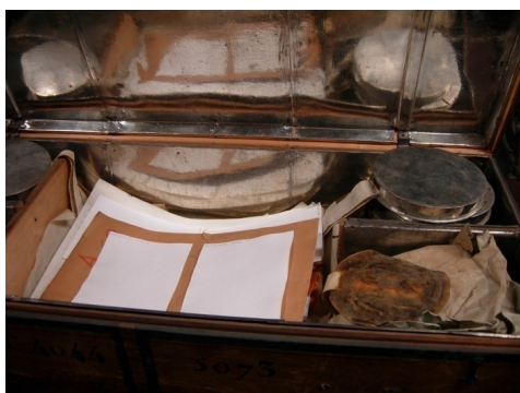
Figure 5. Constitution box (1790), poplar, French National Archives, room 117, mezzanine, A/69 – © A.-L. Dupont.

The impact of the microenvironment in five wooden boxes at the French National Archives was studied. Three out of the five boxes were those that were also used for the SPME sampling reported above. The fourth one was an empty box, which was added to the test to differentiate the impact of the wood emissions from those of the box content. The fifth box was made of poplar which resembles boxes from the eighteenth century. However, it could not be studied by dendrochronology as sampling was not possible. It contained geographical maps on paper with a silk lining. Examples are shown in Figures 5 and 6.