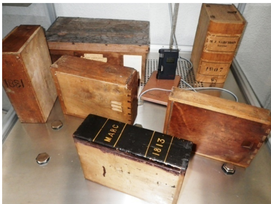
Figure 3. The boxes of the archives of the Lot and Hautes-Pyrénées in the climate chamber – © M. Dubus.

The climate performance tests were carried out using a climate chamber. Similar controlled relative humidity fluctuations (50 to 80 %) were applied to each box. The boxes were weighed at the start of the experiment and at the end of the experiment to evaluate the water mass loss or gain. Our hypothesis here was that water vapour was the main exchange between the box and its surroundings [5-10].