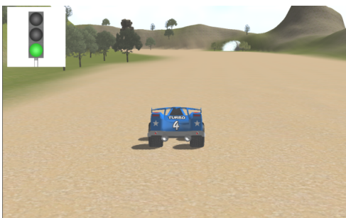
Figure 1: Karting driving task

It allows using different applications, by controlling an object (real or virtual) trajectory through movements of right hand, left hand, or both hands simultaneously. Right and left hand movements result in respectively a left and right rotation, whereas both hands movements move the object forward [1], [2].