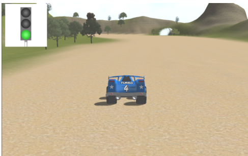
Figure 1: Karting driving task

It allows using different applications, by controlling an object (real or virtual) trajectory through movements of right hand, left hand, or both hands simultaneously. Right and left hand movements result in respectively a left and right rotation, whereas both hands movements move the object forward [1], [2].