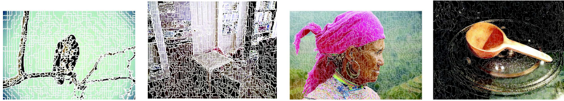
(a) Image 42049 of BSD: K = 472 ; UE = 0.03 ; FBR = 0.99 . (b) Image 00001315 of NYU: K = 905 ; UE = 0.07 ; BR = 1 . (c) Image : img-010 of HSID: K = 1445 ; FBR = 0.66 . (d) Image : img-025 of HSID: K = 928 ; FBR = 0.61 .