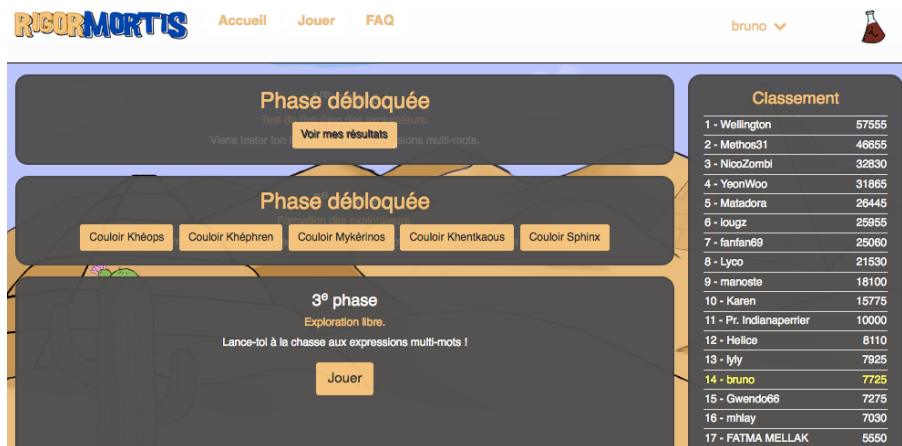
Figure 1: Interface for game selection.