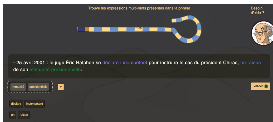
Figure 2: Interface for the annotation of the MWEs.

The interface, inspired by that of TileAttack (Madge et al., 2017), allows users to annotate multiple and discontinuous MWEs (see Figure 2). It should be noted that the intuition task is part of a larger gamified platform and that, while the participants did not gain points in this phase, they did in the other phases (see Figure 1).