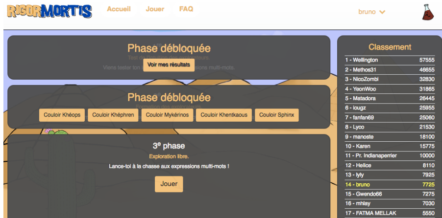
Figure 1: Interface for game selection.