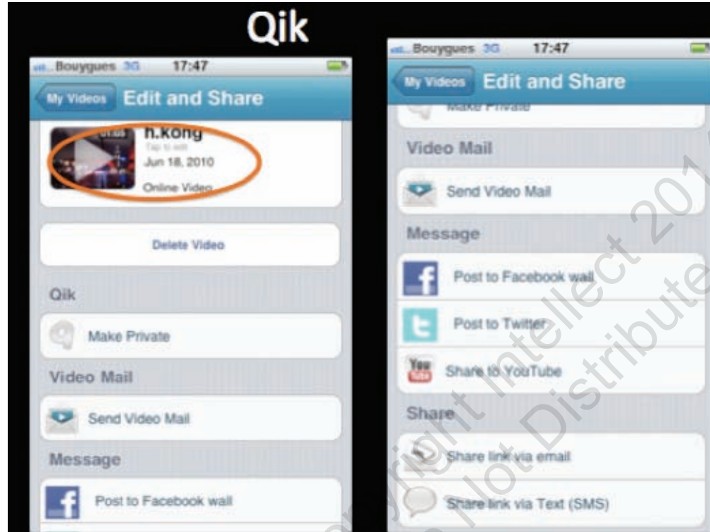
Figure 3: Screenshot of Qik's mobile sharing possibilities, 2012.