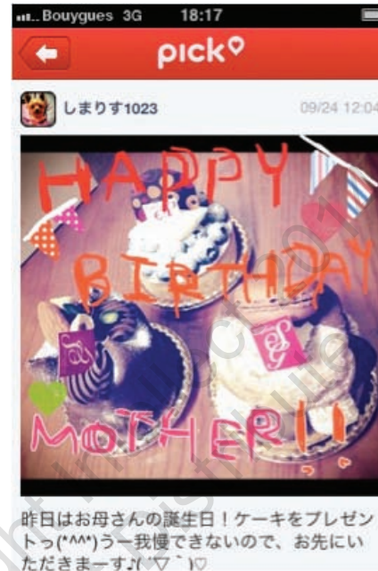
Figure 2: Screenshots taken from two different Pick users.