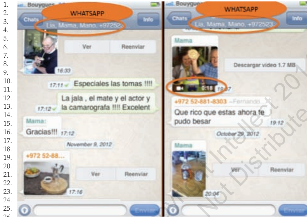
Figure 4: Screenshot of WhatsApp from my personal mobile phone.