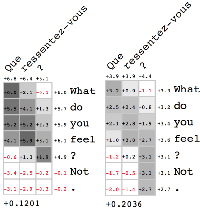
Figure 2: Sentence pair with similarity scores produced by our model when trained with PU examples (right) and over PURI examples (left). Aggregation scores (Eq. (2)) are shown next to words. Matrices contain alignment scores. Sentence similarities (Eq. (1)) are below matrices.

Figure 2 illustrates the output of our network when trained using PU examples (right) and PURI examples (left). The former (right) fails to predict some divergences, most likely because its training set does not contain sentences mixing divergent and non-divergent words. Furthermore, the network trained with PURI examples correctly assigns a lower similarity score to this pair, as both sentences do not convey the exact same meaning.