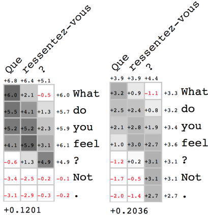
Figure 2: Sentence pair with similarity scores produced by our model when trained with PU examples (right) and over PURI examples (left). Aggregation scores (Eq. (2)) are shown next to words. Matrices contain alignment scores. Sentence similarities (Eq. (1)) are below matrices.

Figure 2 illustrates the output of our network when trained using PU examples (right) and PURI examples (left). The former (right) fails to predict some divergences, most likely because its training set does not contain sentences mixing divergent and non-divergent words. Furthermore, the network trained with PURI examples correctly assigns a lower similarity score to this pair, as both sentences do not convey the exact same meaning.