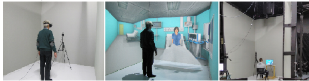
Figure 1: Participants interacting with the virtual patient with different virtual environment displays (from left to right): virtual reality headset, virtual reality room, and PC.

constituted of a 3m deep, 3m wide, and 4m high cubic space with three vertical screens and a horizontal screen (floor). A cluster of graphics machine makes it possible to deliver stereoscopic, wide-field, real-time rendering of 3D environments, including spatial sound. This offers an optimal sensorial immersion of the user. The environment has been designed to simulate a real recovery room where the breaking bad news are generally performed. The virtual agent based on the VIB platform [Pelachaud, 2009] has been integrated in by means of the Unity player.