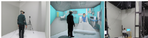
Figure 1: Participants interacting with the virtual patient with different virtual environment displays (from left to right): virtual reality headset, virtual reality room, and PC.

constituted of a 3m deep, 3m wide, and 4m high cubic space with three vertical screens and a horizontal screen (floor). A cluster of graphics machine makes it possible to deliver stereoscopic, wide-field, real-time rendering of 3D environments, including spatial sound. This offers an optimal sensorial immersion of the user. The environment has been designed to simulate a real recovery room where the breaking bad news are generally performed. The virtual agent based on the VIB platform [Pelachaud, 2009] has been integrated in by means of the Unity player.