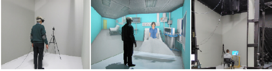
Figure 1: Participants interacting with the virtual patient with different virtual environment displays (from left to right): virtual reality headset, virtual reality room, and PC.

In order to collect the interaction and create the corpus of human-machine interaction in the context of breaking bad news, we have implemented a specific methodology. First, the doctor is filmed using a camera. His gestures and head movements are digitally recorded from the tracking data: his head (stereo glasses), elbows and wrists are equipped with tracked targets. A high-end microphone synchronously records the participant's verbal expression. As for the virtual agent, its gesture and verbal expressions are recorded from the Unity Player. The visualization of the interaction, is done through a 3D video playback player we have developed (Figure 2). This player replays synchronously the animation and verbal expression of the virtual agent as well as the movements and video of the participant.