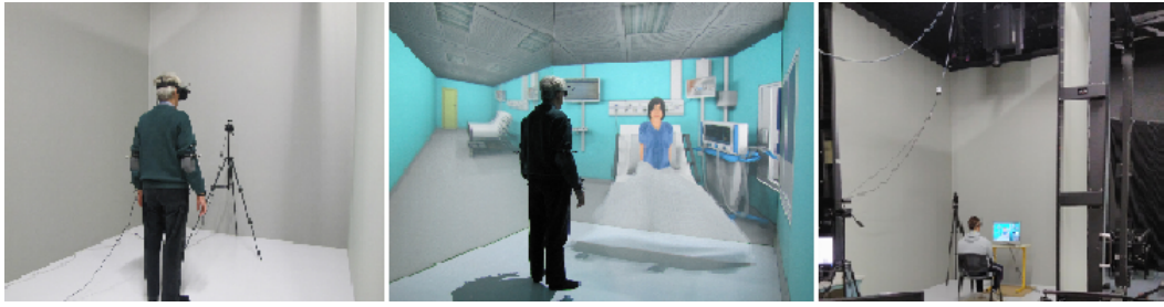
Figure 1: Participants interacting with the virtual patient with different virtual environment displays (from left to right): virtual reality headset, virtual reality room, and PC.

In order to collect the interaction and create the corpus of human-machine interaction in the context of breaking bad news, we have implemented a specific methodology. First, the doctor is filmed using a camera. His gestures and head movements are digitally recorded from the tracking data: his head (stereo glasses), elbows and wrists are equipped with tracked targets. A high-end microphone synchronously records the participant's verbal expression. As for the virtual agent, its gesture and verbal expressions are recorded from the Unity Player. The visualization of the interaction, is done through a 3D video playback player we have developed (Figure 2). This player replays synchronously the animation and verbal expression of the virtual agent as well as the movements and video of the participant.