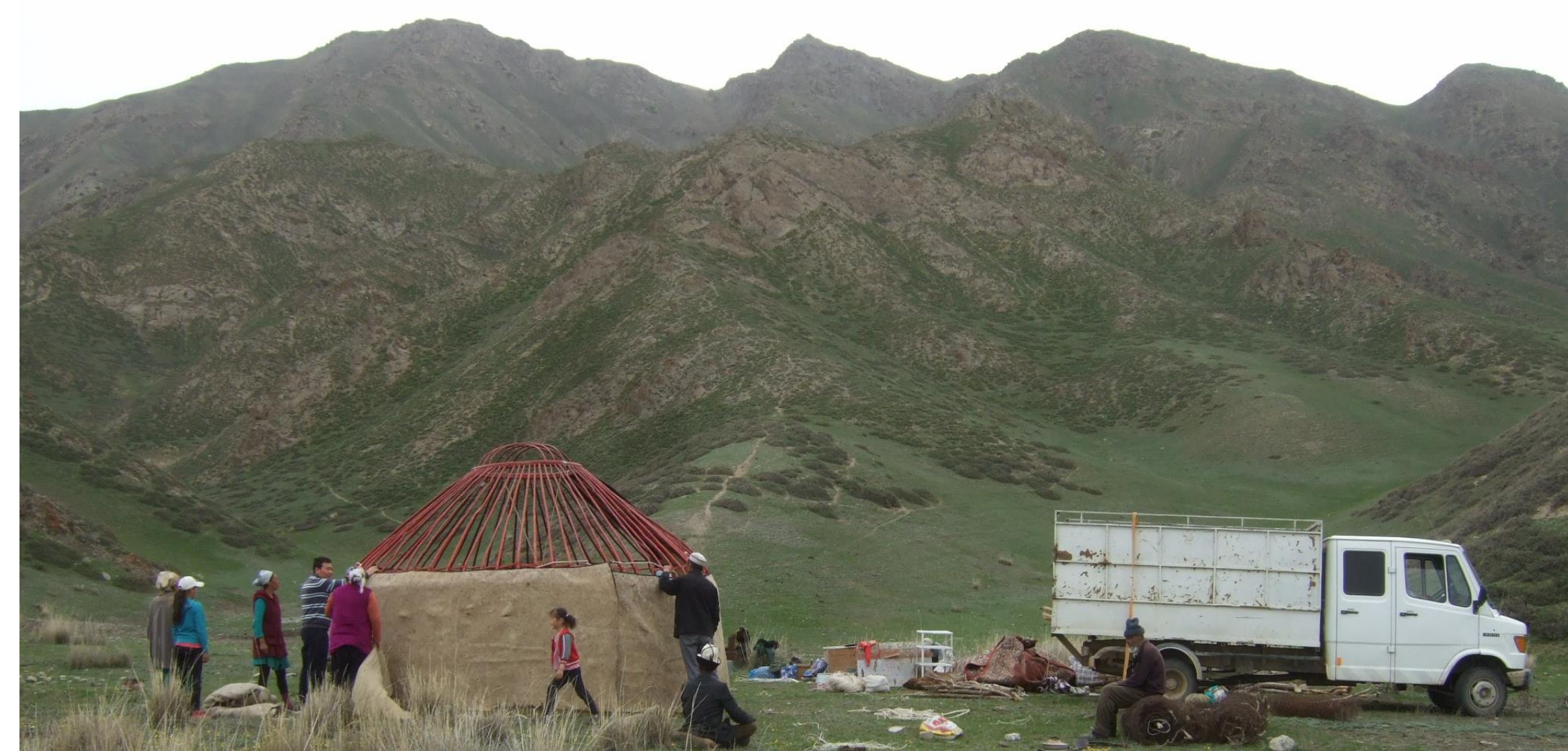
Shepherds setting up their yurt for the first time on spring pastures. The pasture they use was allocated by other shepherds nearby and not by the PUU

PUUs coordinate their actions regarding the price setting for pasture users from other PUUs, the dates of migration and the number of animals allowed. These issues have potential for conflicts, however, the creation of PUUs associations at district level at their initiative shows positive results.