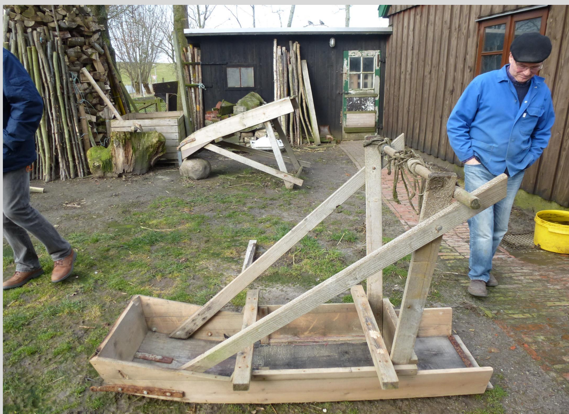
The sled of Erhard Djuren, in Wremen © Anatole Danto, 2015.