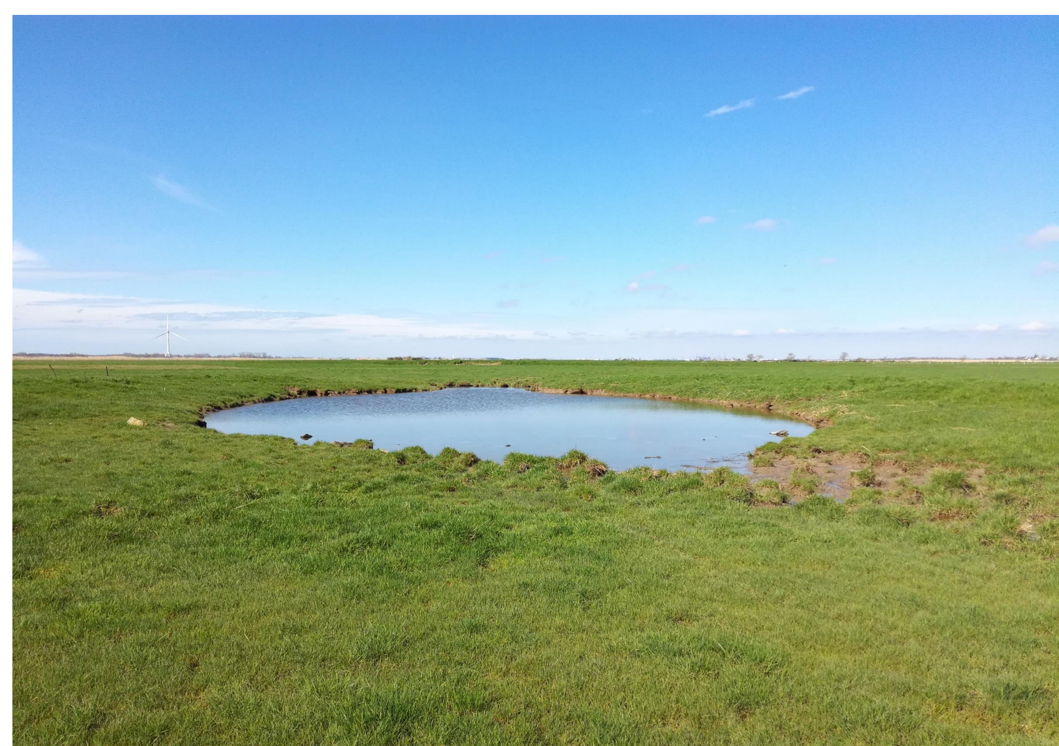
Image 2: Ile de Pierre-Rouge during the day with a pond, used for cattle and for waterfowl.