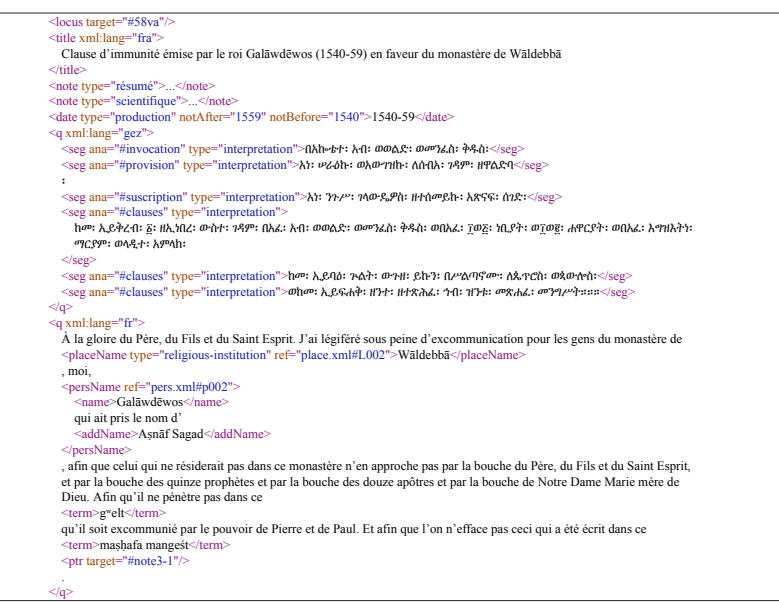
Fig. 1. XML mark-up of a document (BNFabb152#a2).

and classical by its situation within the tradition of diplomatics. The electronic publication of these documents has a number of objectives in mind: gathering, editing, translating, annotating, analysing these primary sources. EMA privileges the use of the TEI (Text Encoding Initiative) mark-up, a versatile language that can report on the different states of a text: its content, its materiality, and also the intention, notes, comments of all the authors, scribes, readers, other users, including the scholars participating to the digital edition. Indeed, one of the main scientific assets of TEI mark-up is that data can be extracted directly from the document. Encoding preserves the integrity of the text while generating layers of enriched data.<sup>3</sup> It offers also the possibility of interoperability, and guarantees that this publication of sources will evolve in harmony with tools and practices in international use. A starting collaboration with the project Beta maṣāḥaft at Hamburg has proven that interoperability is not an empty word.