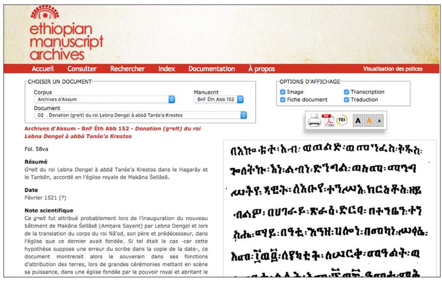
Fig. 3. View of the reproduction, the summary, and the scientific note accompanying a land charter (as appearing on the EMA portal).