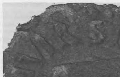
Figure 9: Roman coin: part of the textured mesh with edge enhancement.

Photomodeler runs on windows operating system. The first step is to generate a calibration file of the camera by taking a picture of special test card. Photomodeler uses couples of pictures with a small displacement of the camera to compute the point cloud. 2 types of reconstruction are possible: