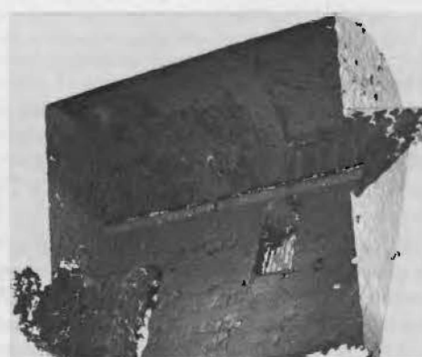
Figure 3: Moissac chapel: part of the textured mesh.