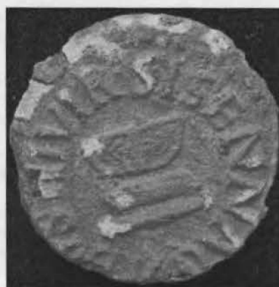
Figure 7: Roman coin.