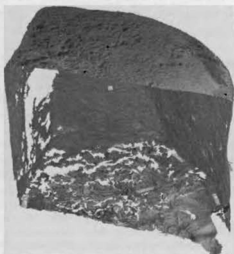
Figure 6: Catacombs: part of the textured mesh.