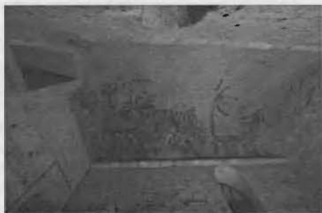
Figure 1: Moissac chapel.