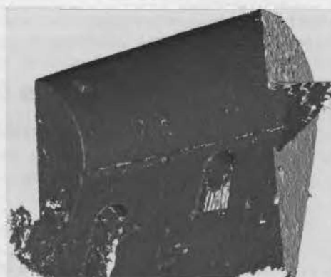
Figure 2: Moissac chapel: part of the mesh without texture.