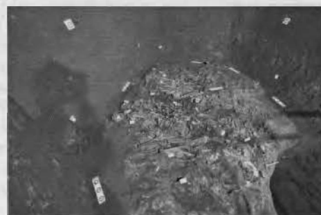
Figure 4: St Pierre et Marcellin catacombs.