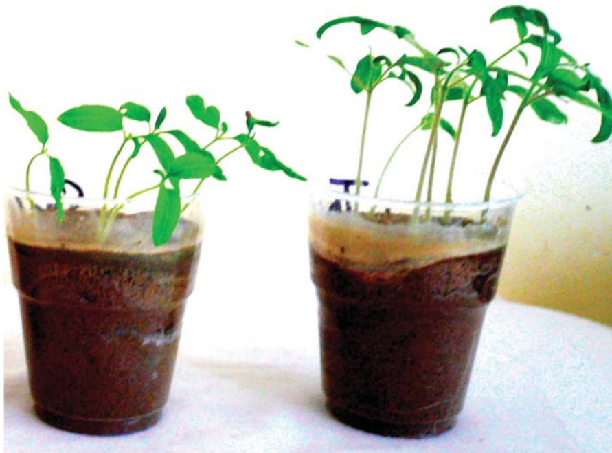
Figure 3. Healthy seedlings of tomato cv. Aïcha obtained by sowing untreated seeds in non-infested soil as negative control (left) and bacterised seeds with spores of S. asterosporus strain SNL2 (right) sowed in infested soil with spores of F. oxysporum f. sp. radicis lycopersici . The picture was taken after 2 weeks of culture under standard greenhouse conditions.

Production of antifungal compounds is an advantage in the biocontrol of phytopathogenic fungi since antifungal compounds can easily diffuse in the soil and consequently