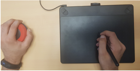
Figure 3: TDome + Pen

In our bimanual approach we therefore use TDome in the non-dominant hand to set context (e.g. reaching a display), and the pen in the dominant hand (Figure ) to perform a detailed interaction (e.g. positioning object in exact location), hence respecting Guiard's findings. In addition, the main functionalities of a keyboard – Typing and Accessing shortcuts – can be done with the pen and TDome respectively, thus, allowing us to exclude the keyboard from this technique and eliminating any homing time cost.