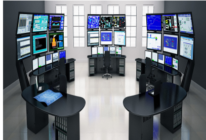
Figure 1: Control room setup https://www.winsted.com/markets/oil-gas/