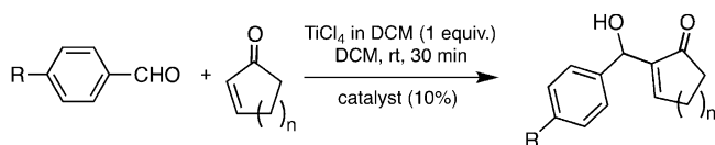
Table 2: Comparison of the catalytic activity of 1a and 1b with various substrates.