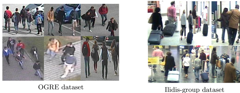
Fig. 3. Some example images from people group datasets.

explicitly capture both person and group context features, we divide the input image \mathbf{I} into two input images to process them separately.