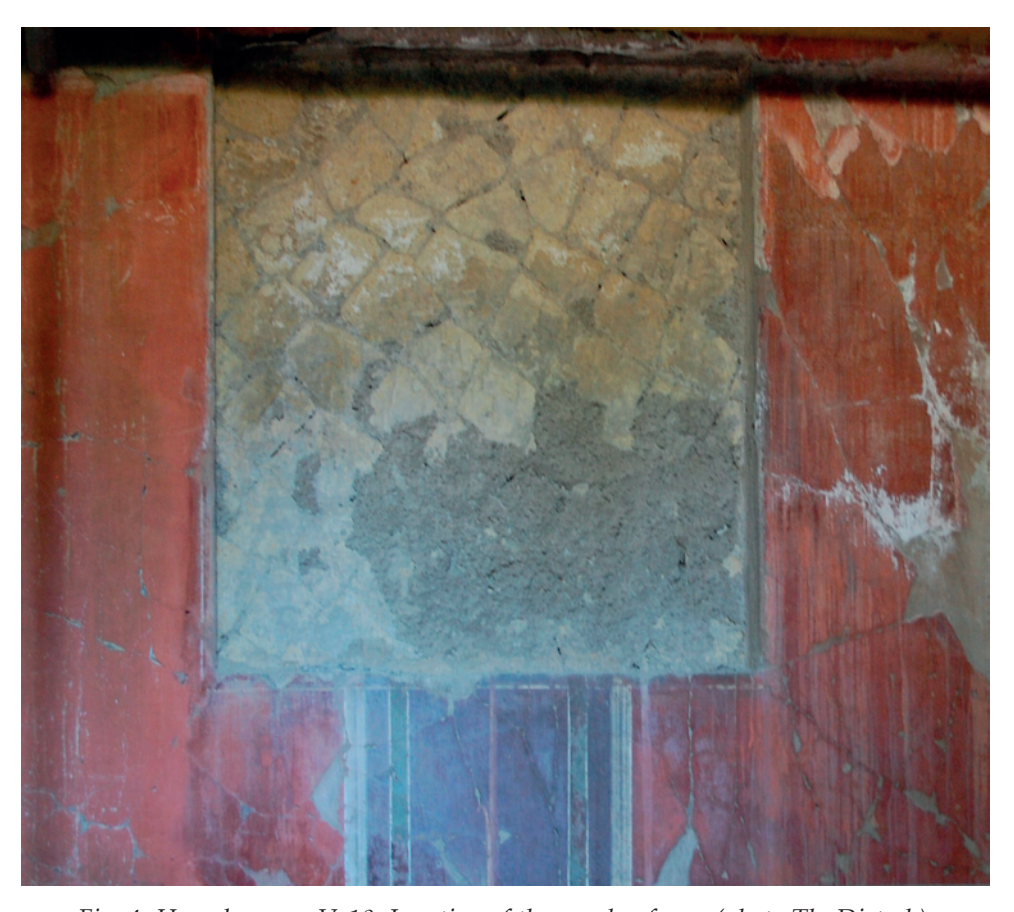
Fig. 4. Herculaneum, V, 18. Location of the wooden frame (photo Th. Dietsch).

21.<sup>20</sup> This indicates that a functional relationship existed at least for an undefined period between the two rooms (20 and 21) on the ground floor as well as the rooms located immediately above. On the basis that this relationship existed up to the second earthquake a functional link via a doorway gave access to rooms 20 and 21 from the atrium of the Casa del Bicentenario between the Augustan period and the second earthquake.