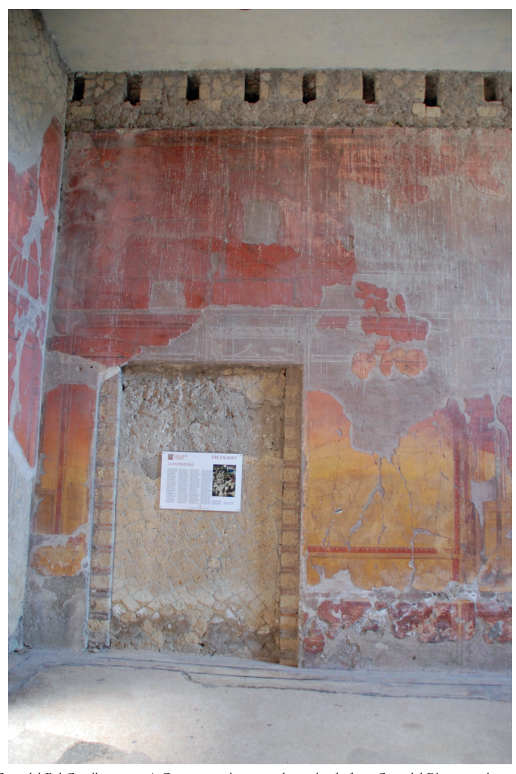
Fig. 3. Casa del Bel Cortile, oecus 4. Oecus opening over the peristyle from Casa del Bicentenario until 70-75. During the second earthquake, part from the walls fall down: the doors opening on the peristyle, the uprights of the north door and the south facade are rebuilt. The fourth style painting (post 62) does not cover the blocked door.