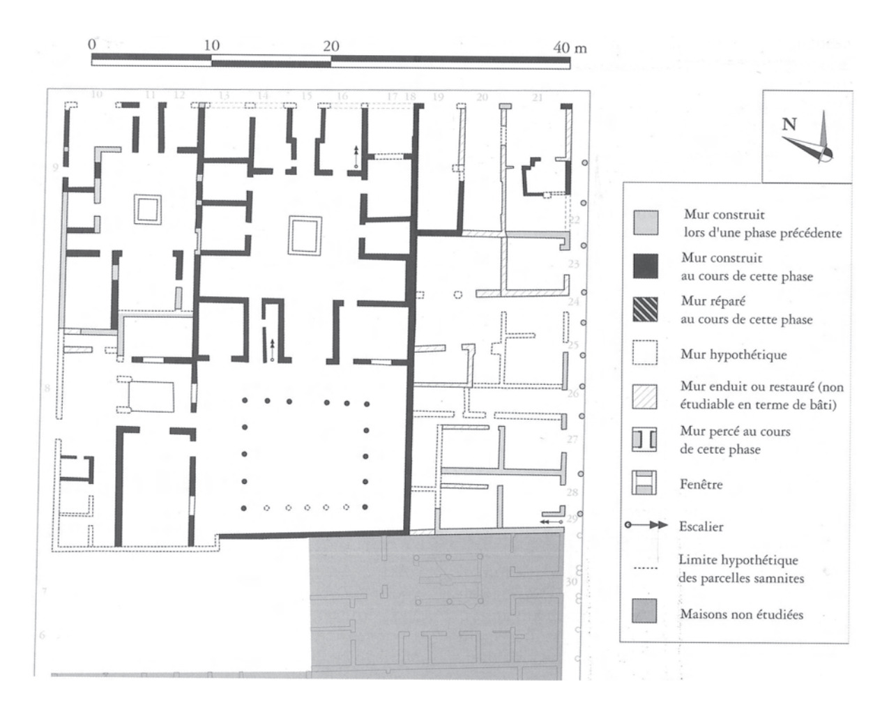
Fig. 1. Plan of insula V of Herculaneum, northern part, Augustan phase (from Monteix 2010, fig. 173).

superficially its unexpected layout. Indeed the analysis of the architecture and decoration of this house should not be limited to a purely synchronic reading of the remains as they were in AD 79. To obtain a good understanding of the whole it is necessary to undertake a diachronic study of the buildings and the decorations associated with it. Up to the mid 70s the Casa del Bel Cortile was part of the vast Casa del Bicentenario from which it was only separated after the second earthquake, that is to say between 70 and 75 ( fig. 1).8