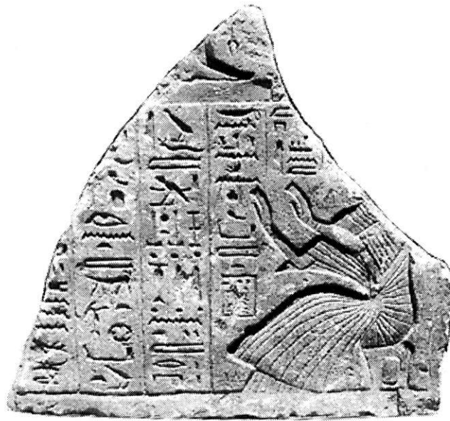
The fragment of stela of Mahu (?). Luxor Supreme Council of Antiquities Magazine n° 48.