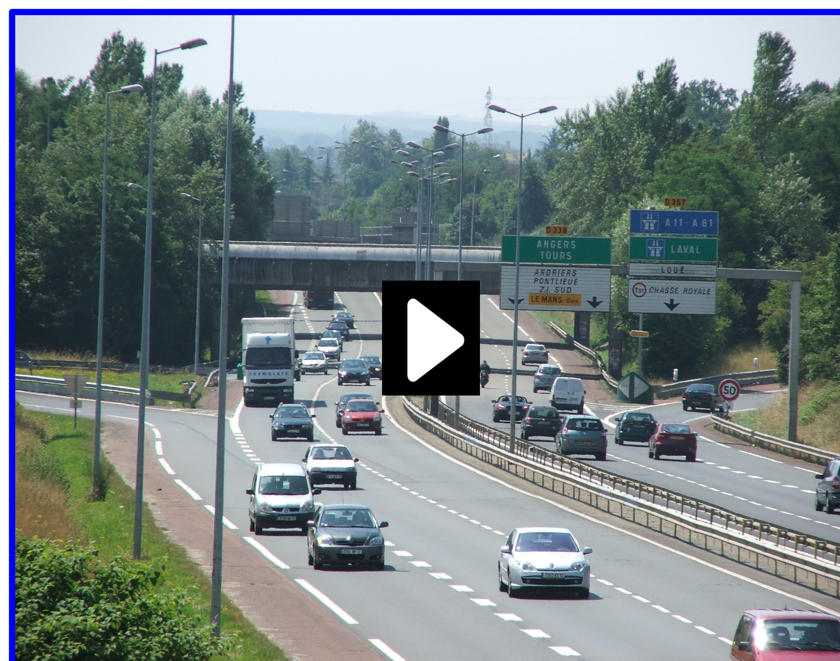
Problem is posed using a video

Quelle est l'heure de départ des 24h ? on n'a pas le nombre de voitures. est-ce qu'on compte aussi les camions ? Il y a 2 côtés à l'autoroute, est-ce qu'on compte sur les 2 côtés ?