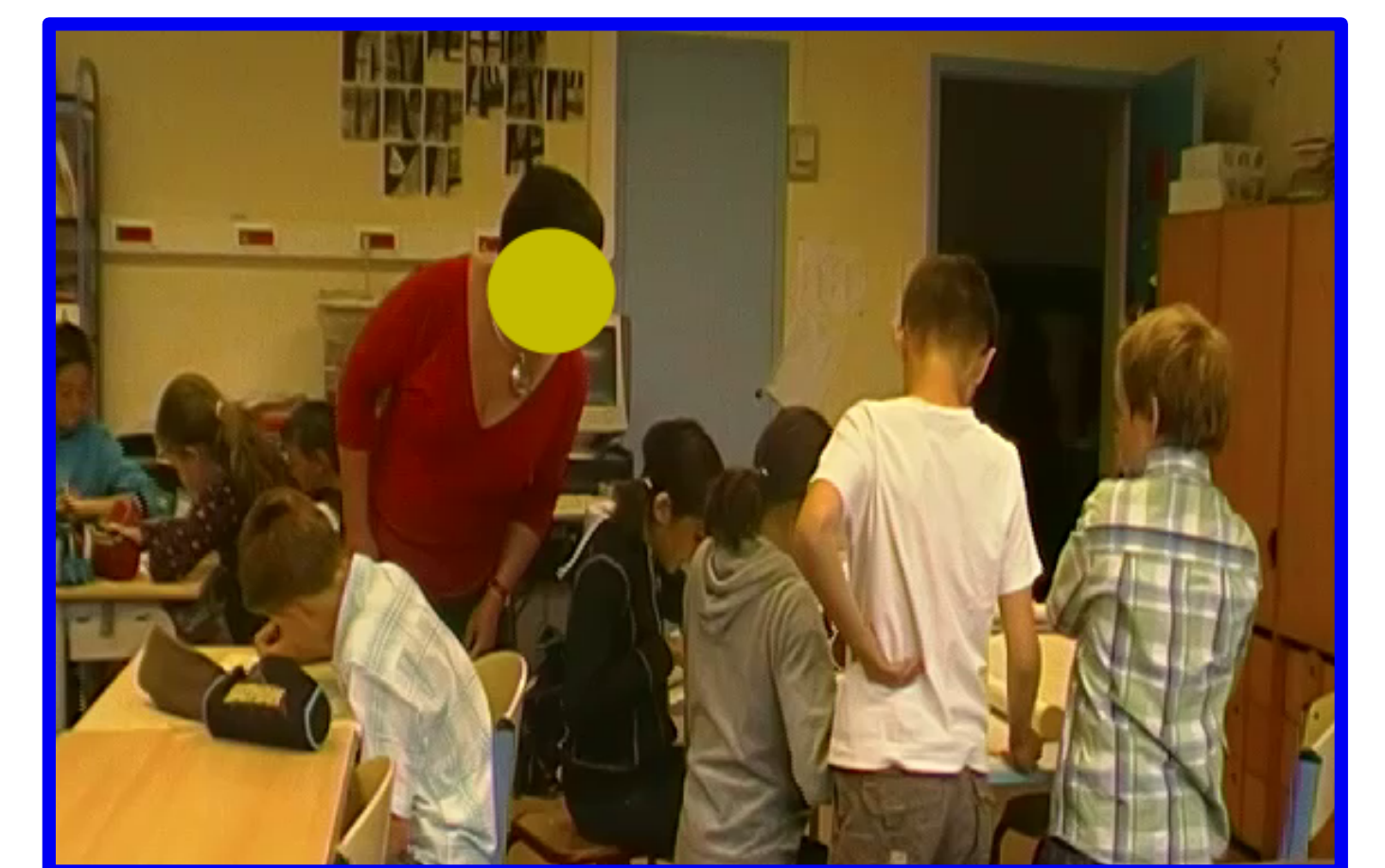
Students at work