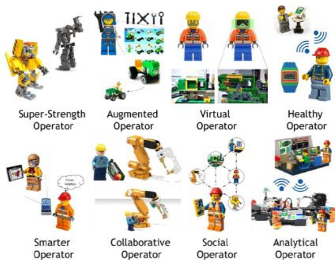
Figure 1 – A typology of operator 4.0 (from Romero et al., 2016)

Romero, Bernus, Noran, Stahre, Fast and Berglund (2016) detail the different “increase” of the operator 4.0. They propose a typology based on the technological pillars of industry 4.0 listed by Rüssmann et al. (2015), and secondly on the nature of the assistance (physical, sensory or cognitive) provided to the operator (Figure 1).