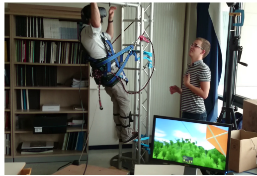
Figure 2: The work-at-height simulator in operation.

We expect our simulator to be deployed in companies dealing with work at height as an additional tool to detect acrophobic persons and thus hire only non-acrophobic workers. Though our simulator meets the first industrial requirements, it is still in development and further functionalities need to be added. Especially we could integrate other sensory cues such as air motion to simulate gusts of wind while at height. As the tasks addressed here are usually performed with live power lines, we could add a haptic feedback when a user touches a virtual power line.